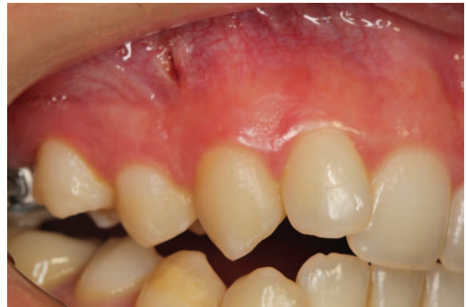
Figure 2. An example of the piezoincision openings.

After a 1-day latency period, the frontal split screw was activated once a day by a 90° turn (0.20 mm/day) for 10 days; this was performed by each