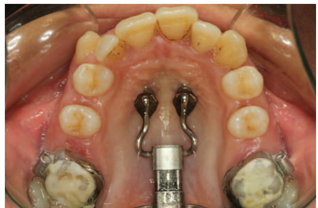
Figure 3. An example of a hybrid memory distalization unit in retention.

Pre- and posttreatment lateral digital cephalograms (Vatech Pax Uni3D, Gyeonggi d.d.o., Korea) of the 9 patients were taken with using the same equipment, conditions and operator and then evaluated by one author (C.I.) using cephalometric analysis software (Ax.Ceph, AUDAX d.o.o., Ljubljana, Slovenia) to eliminate the interobserver error factor. A horizontal reference plane was constructed with a 7° angle to the sella-nasion plane and the vertical reference plane was constructed perpendicular to the horizontal reference plane at the sella point for measurement. In