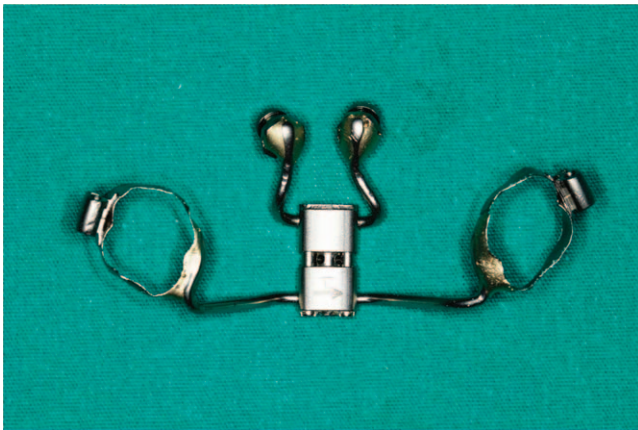
Figure 1. Fabricated hybrid memory distalization unit.

transfer miniscrews were fitted in abutments in silicon and a high-strength dental stone cast was made.